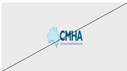
Don't stretch, distort, warp or skew your logo