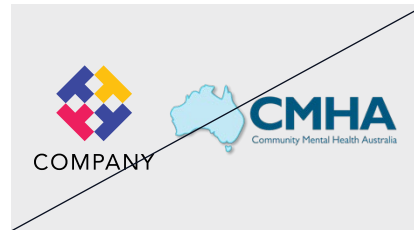
Don't place other elements within the logo's Clear space zone