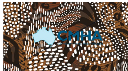
Don't place your logo on a pattern