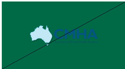
Don't place inappropriate brand colours behind your logo

To maintain design integrity, always apply the logo appropriately. It can be tempting to add effects or extra elements, but less is more for a professional and credible image. Here are some examples of what not to do.